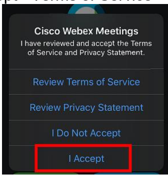
Updated - 4/9/2020 4:46 PM